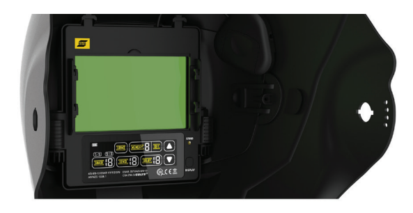
High optical class ADF, with color touch screen interface.