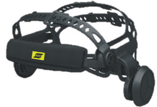
Halo comfort 5 point harness (front view).